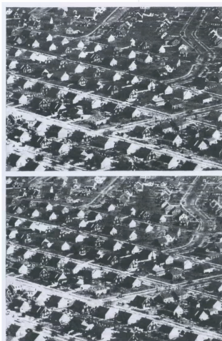
Levittown Levittown II, 2015.

It’s the American Dream: or its hellish opposite. But either way, it is far more than an opening-credit cliché. For Levittown is a real place, a community of 20,000 houses built on Long Island for the benefit of veterans returning to a severe housing shortage at the end of the second world war. The units arrived prefabricated and the builders - William Levitt and co - eventually became so skilled they could put one up in under 17 minutes. Each house was tiny, identical and came with the new-fangled television set ready installed. Levittown was the original mass-produced American suburbia.