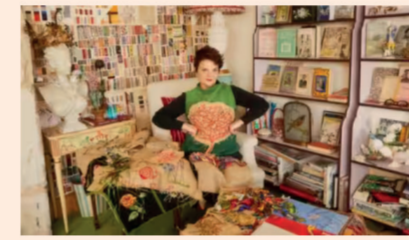
HTSI Lulu Guinness's life in stitches