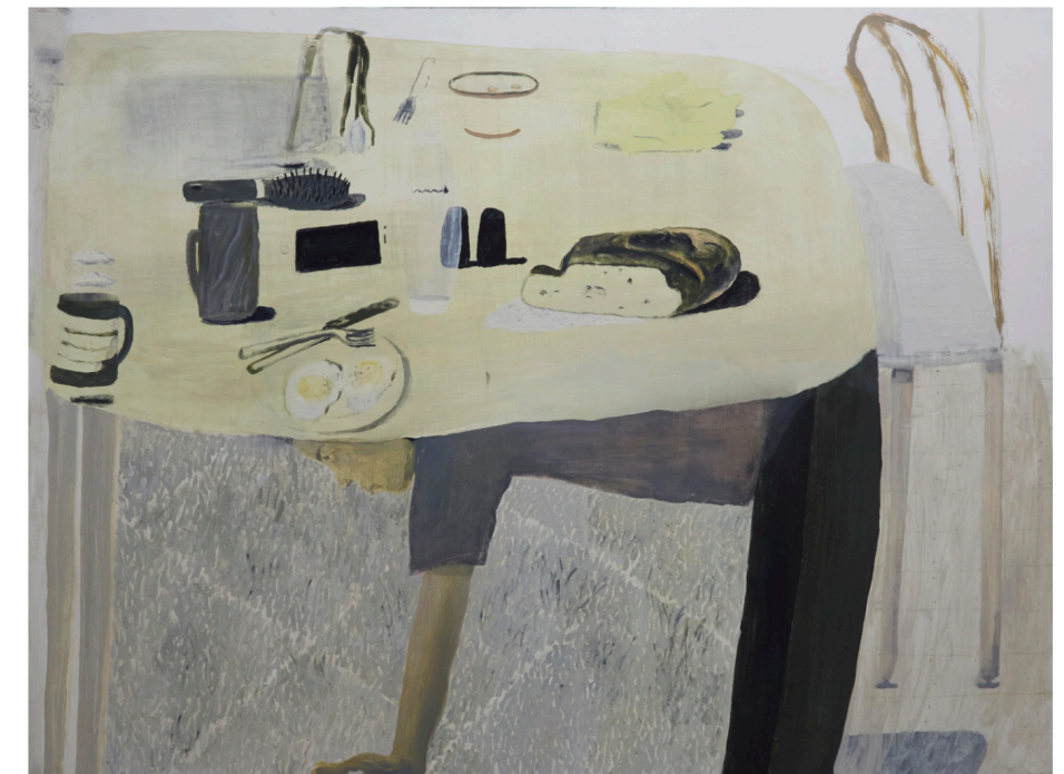
Aubrey Levinthal, "Weighty Table" (2020), oil on panel, 36 by 48 inches

Another indication of her painterly acuity is her use of color. Blue is associated with melancholy, especially after Picasso used it so extensively in his Blue Period (1900-1904). With "Worry (Spaghetti)"'s washed-out yellow, Levinthal picks a color associated with warmth, sunlight, and joy to express melancholy, counteracting the viewer's expectations.