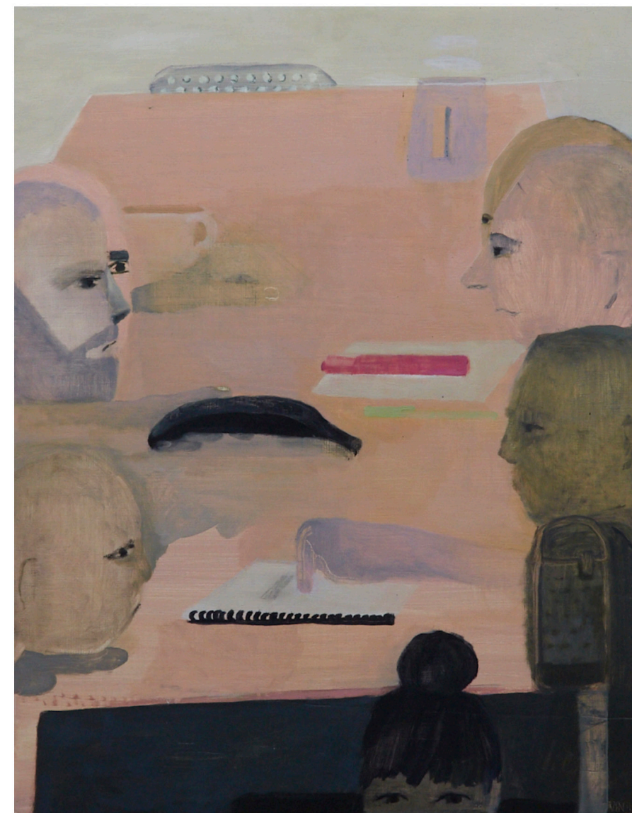
Aubrey Levinthal, "Men's Faculty Meeting" (2020), oil on panel, 30.5 by 23.5 inches

In "Men's Faculty Meeting" (2020), we see six heads (four in full profile and slivers of the two others) thrust out over the table, facing each other, three on each side. The top of an empty chair peers above the far end of the long, dusty pink table, which is angled away from the picture plane. At the bottom of the painting is a woman's face, seen from her eyes up, as the rest is cropped by the painting's bottom edge. This cropping brought to mind Philip Guston's "The Artist" (1977). Why are the men at the table ignoring her? Why is she facing away from them? What is the object that looks like a banana lying on the table? Why is it completely black? What about the finger that is pointing straight down, like at nail, at the black-ringed report?