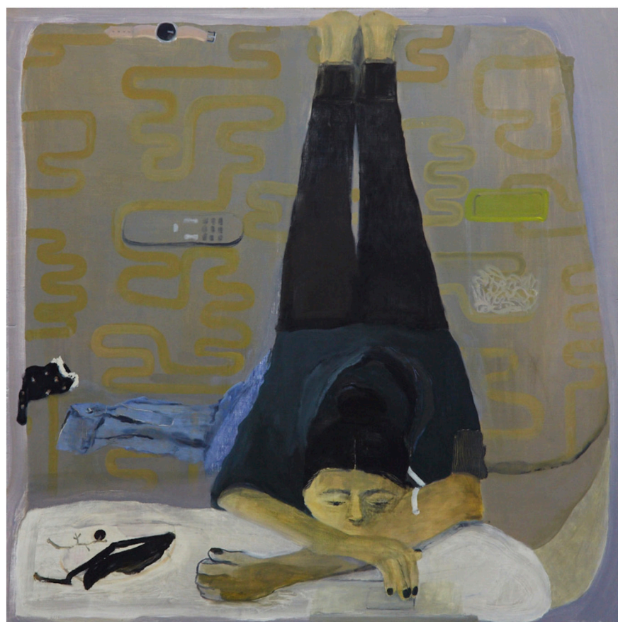
Aubrey Levinthal, "Bed (April)" (2020), oil on panel, 36 by 36 inches

Levinthal moves this extreme situation into the most private domestic interior, the bedroom, and replaces Titian's suffering male figure with a female looking at her computer. One by one, the details come into focus. At the bottom of the painting, we see that the woman has painted her fingernails black. At the top of the bed, on the left side, there is a wristwatch with a black face and a muted, dusty pink wristband, an odd color combination. It presides over the painting, reminding us that we all live in time. About a third of the way down the bed is a remote control, placed so that the pattern of the bed covering snakes around its edge, visually holding it in place. This line reinforces the feeling of gravity established by the placement of the woman's feet.