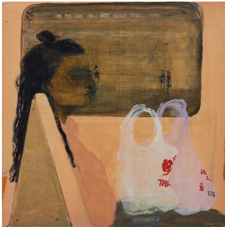
Aubrey Levinthal, "4pm Subway" (2020), oil on panel, 24 by 24 inches

I could start off by stating the obvious — that Aubrey Levinthal is one of the most interesting and engaging figurative painters at a time when many artists are working in this vein. But that alone does not get to what makes this artist special.