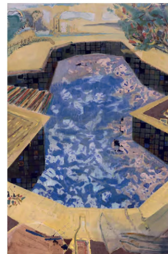
Nick Goss, Osea Island

Nick Goss's intriguing paintings, built up slowly in thin layers over screenprinted images, suggest memories and places without completely committing to realism. There is an element of documentary in the way he might paint a table and chairs, a window or a swimming pool, but there is also a dream-like strangeness to these scenes, an ambiguity which is never fully explained. In a new text for the Ingleby Hettie Judah writes: 'The peculiar alchemy of [Goss's] paintings lies not in their ability to convey the atmosphere of actual place, but to construct an image of a location that evokes a kind of deja vu .' inglebygallery.com